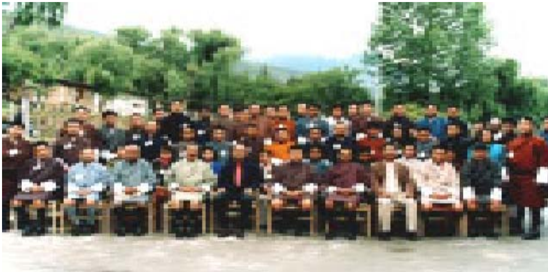
The Hon'ble Finance Secretary, Director of DRC and Resource Persons from Malaysia with the course participants

An in country training program on Harmonized System of Nomenclature (HSN) and WTO Valuation Agreement started from 21 May, 2001 and will end on June 15, 2001. This training program is the first of its kind to be ever conducted in the country with resource persons from outside the country. It is also the first Training Program jointly conducted by AKMAL, Royal Customs Academy Malaysia and the Department of Revenue & Customs. Danida funds the course while resource persons deliver lectures free of cost.