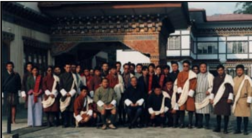
H.E. Finance Minister with the staff of Samdrup Jongkha Regional Office

January 26, 2001 was a memorable day for RRCO Samdrup-Jongkhar when the Regional Director informed the staff that our Honourable Finance Minister, Chairman of Lhengyel Lhentshog has kindly consented to visit this Office, despite his hectic schedule. Our joy knew no bounds. Every member of staff took it as a moment of pride and privilege. The time was indeed momentous for all of us.