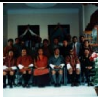
The inaugural of the new office building at Samtse Regional Office

The Regional Revenue and Customs Office of Samtse now has a new office building.