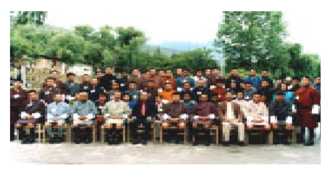
The Hon'ble Finance Secretary, Director of DRC and Resource Persons from Malaysia with the course participants

An in country training program on Harmonized System of Nomenclature (HSN) and WTO Valuation Agreement started from 21 May, 2001 and will end on June 15, 2001. This training program is the first of its kind to be ever conducted in the country with resource persons from outside the country. It is also the first Training Program jointly conducted by AKMAL, Royal Customs Academy Malaysia and the Department of Revenue & Customs. Danida funds the course while resource persons deliver lectures free of cost.