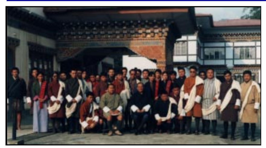
H.E.Finance Minister with the staff of Samdrup Jongkha Regional Office

January 26, 2001 was a memorable day for RRCO Samdrup-Jongkhar when the Regional Director informed the staff that our Honourable Finance Minister, Chairman of Lhengyel Lhentshog has kindly consented to visit this Office, despite his hectic schedule. Our joy knew no bounds. Every member of staff took it as a moment of pride and privilege. The time was indeed momentous for all of us.