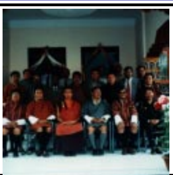
The inaugural of the new office building at Samtse Regional Office

The Regional Revenue and Customs Office of Samtse now has a new office building.